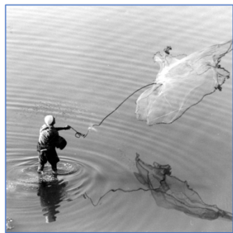
Figure 6: Shore fishing